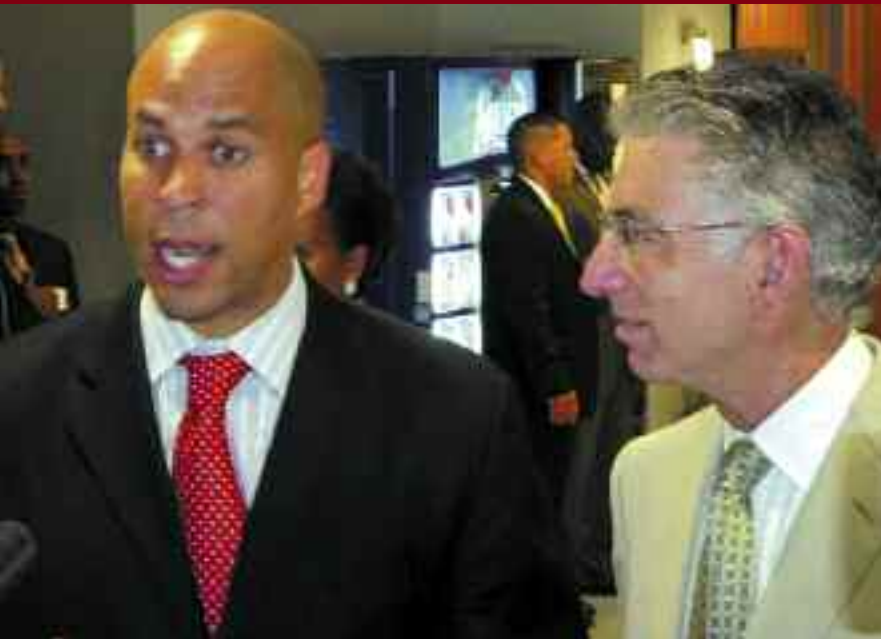
Mayor Cory Booker and Phil Angelides, the Apollo Alliance chairman, hold a news conference on the first day of the summit.

organization of local governments, to identify and address the city's carbon footprint, will be integrated into the city's overall sustainability initiative. If we learned one thing at the summit, it is that collaborative partnerships are necessary to achieve environmental, economic, and equity goals. Collaboration – across city departments, across local, regional, state, and federal agencies, and across the (often wide) public-private sector divide – is essential to fostering truly sustainable projects and commitments, whether the goal is greening the port, greening a neighborhood, or greening local jobs.