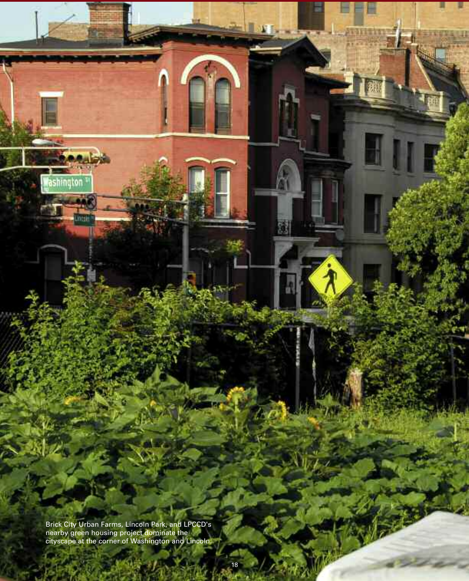
Brick City Urban Farms, Lincoln Park, and LPCCD's nearby green housing project dominate the cityscape at the corner of Washington and Lincoln.