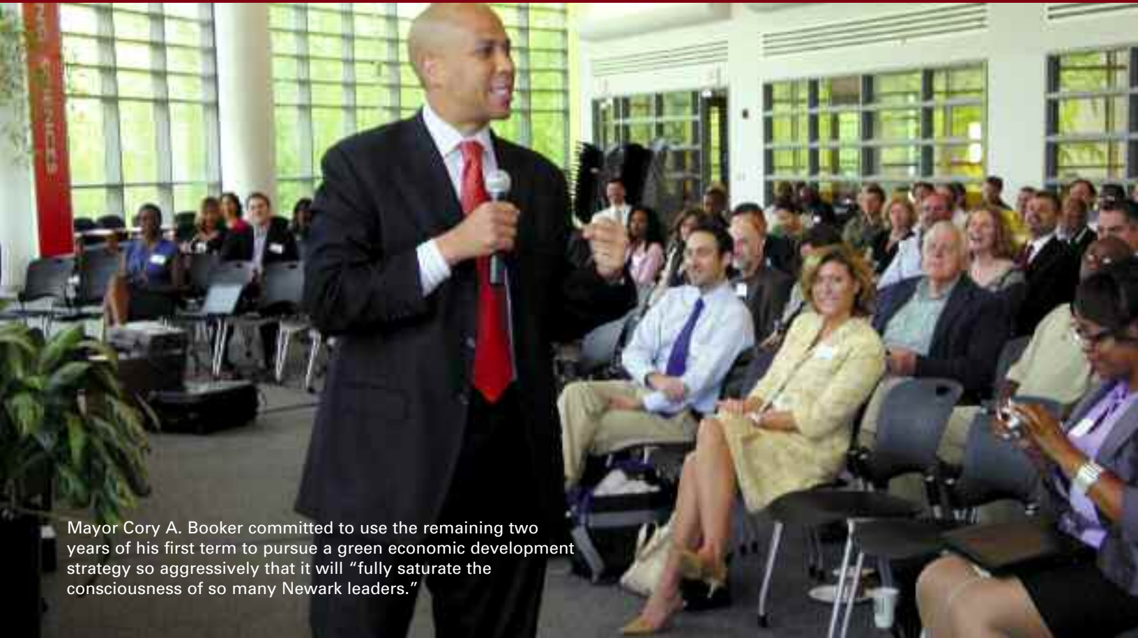
Mayor Cory A. Booker committed to use the remaining two years of his first term to pursue a green economic development strategy so aggressively that it will “fully saturate the consciousness of so many Newark leaders.”